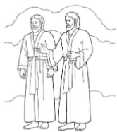
Heavenly Father and Jesus Christ