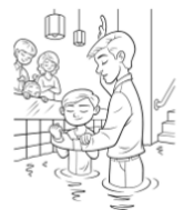
Baptism and Holy Ghost